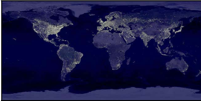
Excessive nighttime lighting is a worldwide issue.

Property lighting is necessary for safety, security and for the enjoyment of nighttime activities. The objective in promoting dark sky friendly lighting is to balance the ability to see safely at night, the desire to preserve the beauty of the night sky, and the need for energy efficient lighting. Poorly designed or poorly installed lighting causes glare that can hamper vision and create a hazard rather than increase safety.