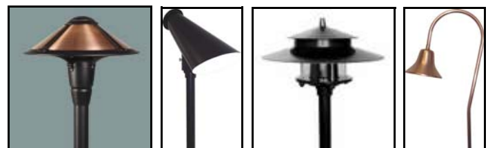
Examples of Dark-Sky Friendly Landscape Lighting

SNOC dominates this market in south-central Ontario with a wide range of garden lighting – sizes, finishes, styles, prices – and can be found easily in lighting stores (Home Depot, Lighting Unlimited, Sescolite, Union Lighting). Other manufacturers supply as well.