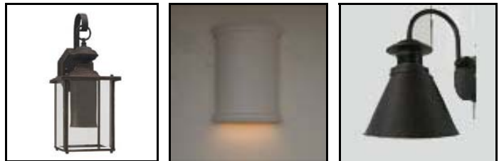
Examples of Dark-Sky Friendly Wall Lanterns

Options range from modern security lighting that look like spotlights with shields (SNOC, Kichler) to modern cylindrical fixtures (Kichler) to antique finished lanterns (Seagull, SNOC, Troy).