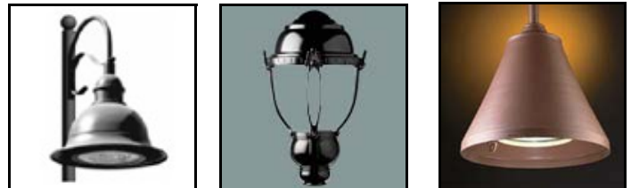
Examples of Dark-Sky Friendly Post-Mounted Fixtures

These are post-mounted fixtures and are lantern like in appearance (Troy, SNOC).