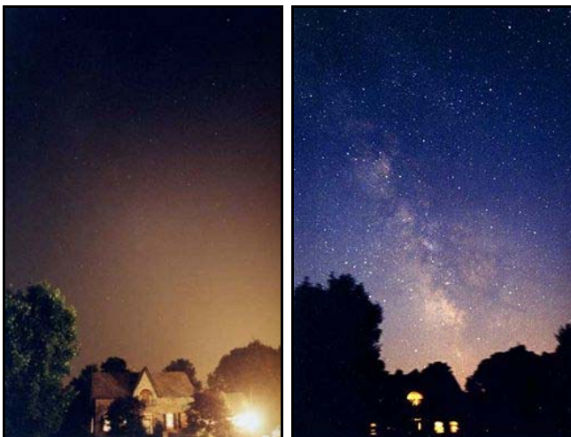
An increasing number of people are subject to light pollution (far left) with the stars only being seen when there is a power outage (near left).